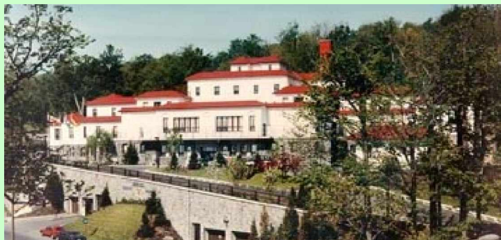
CANADIAN SHRINERS HOSPITAL FOR CHILDREN IN MONTREAL

Managed and Conducted by RAMESES SHRINERS 3100 Keele Street, Toronto, Ontario M3M 2H4 416-633-6317 (Provincial Lottery No. 3136)