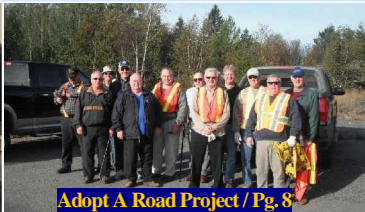
Adopt A Road Project / Pg. 8