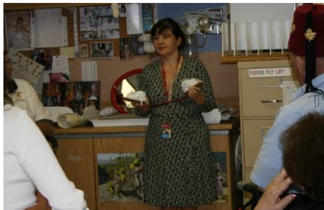
Tour of treatment facilities

The group got to see first hand the various orthopaedic braces and treatments available to children at no cost.