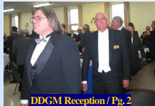
DDGM Reception / Pg. 2