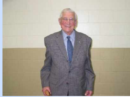
Biography of a loving Freemason Pg. 5