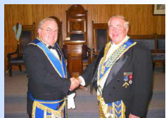
Investing the Grand Steward / Pg. 3

We wish them well and pray for their full recovery