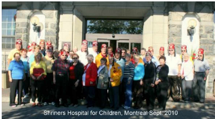
Shriners Hospital for Children, Montreal Sept. 2010

Thirty-nine Sudbury Shrine Nobles and Ladies visited the Montreal Shriners Hospital for Children on September 18 th 2010.