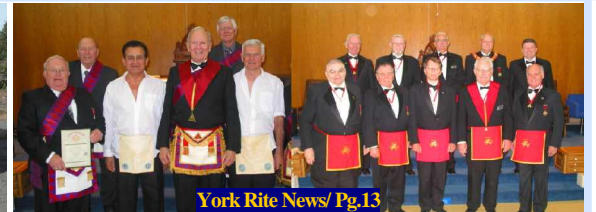
York Rite News/ Pg.13